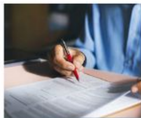
No long-term contracts