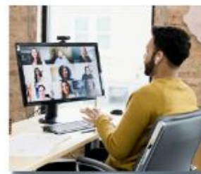
No work from home