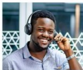
Dedicated Team Members align with your time zone