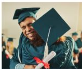
University-Educated Team Members