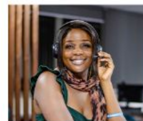
Team Members speak the "Queen's English"